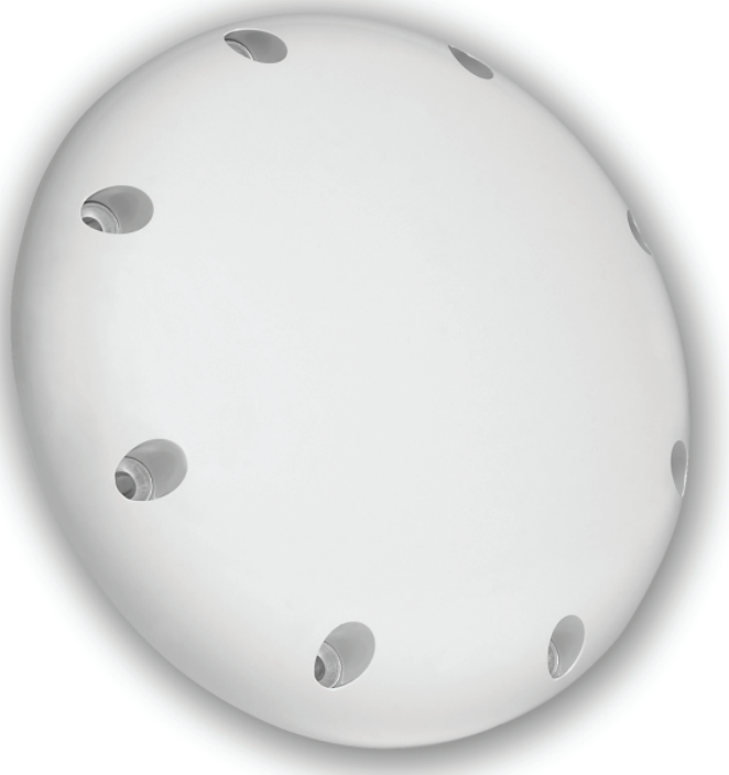
Trimble AV59 GNSS Antenna

The antenna is an aviation type of design. The bulkhead mounting ensures only the rugged radome is exposed to the elements. This is an ideal design for customers building machine control systems. The antenna can be mounted flush with the vehicle surface or on the top of a pole mount. The TNC connector is located on the underside of the unit ensuring the attached cable is also protected from the environment.